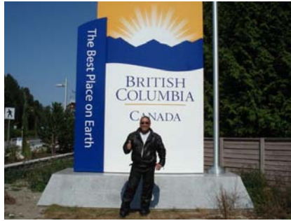
Crossover to Vancouver, BC