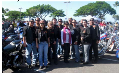
Order's Toys for Tots Participants