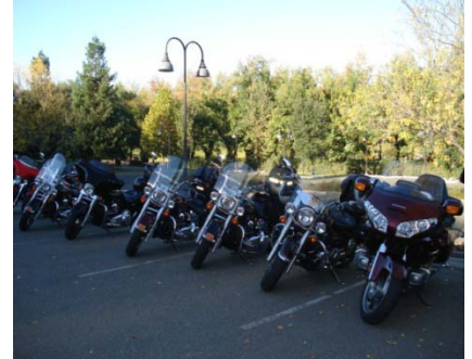
Parking Lot at Beringer Winery