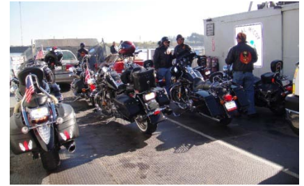
Ferry ride across a Suisun Bay Inlet in Rio Vista

The ride took us through the levees east of Antioch, to include having to take several ferries across the irrigation canals. Nice rural roads, dotted with sheep ranches along the route.